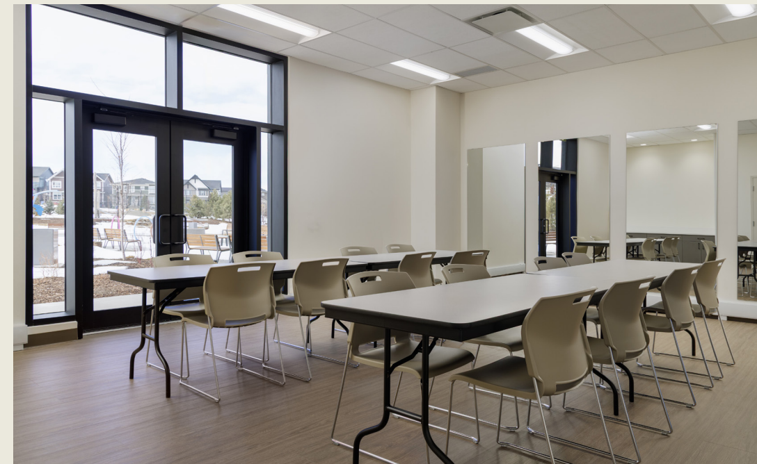
A versatile, bookable space ideal for workshops or small group fitness classes, comfortably accommodating up to 15 guests.