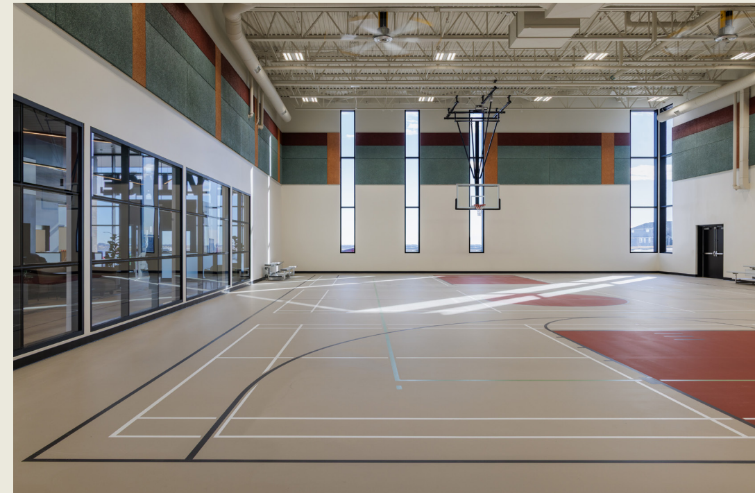
Where sports take center court. Designed for play, not weight racks.