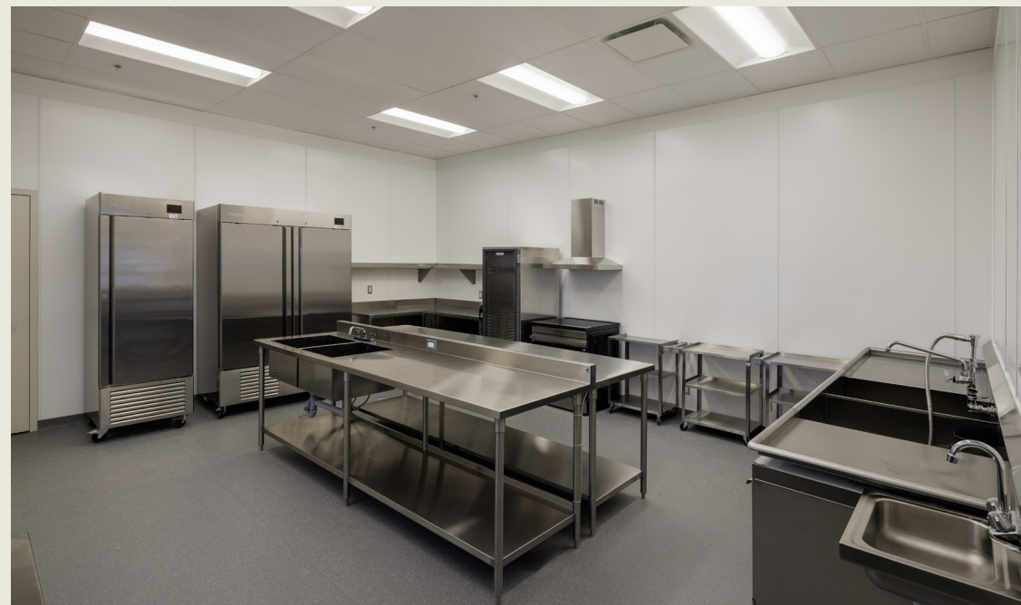
An elegant, spacious venue featuring a wet bar and warming kitchen, available to book for events of up to 120 guests.