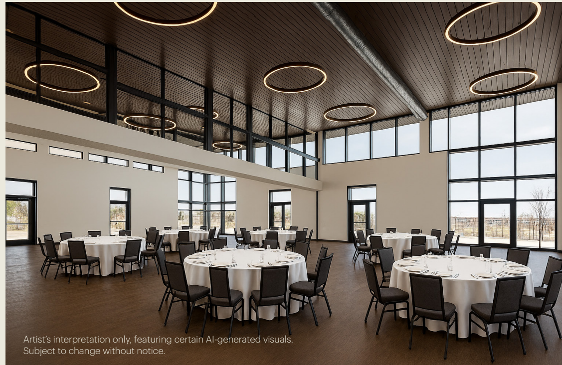
Artist's interpretation only, featuring certain AI-generated visuals. Subject to change without notice.